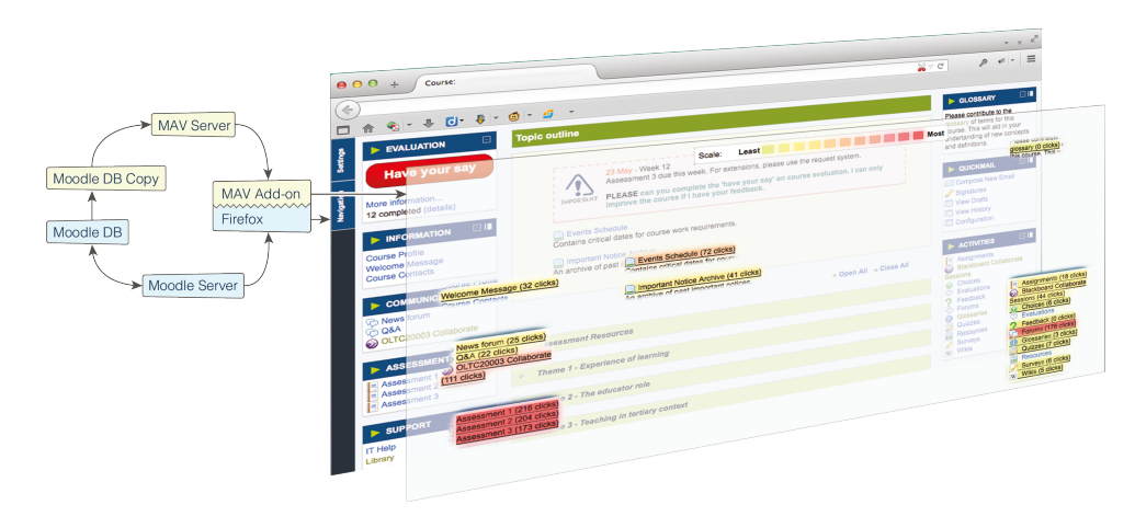
Figure 1: How MAV works

development in favour of more established "vanilla" systems (off-the-shelf with limited or no customisations). This new strategy made it unlikely that the MAV would be re-implemented directly within Moodle, and the augmented browsing approach might be viable longer term. As the MAV was being developed and refined, it was being tested by a small group of teaching staff within the creator's team. Then in September 2013, the first official trial was launched making the MAV available to all staff within one of CQUniversity's schools.